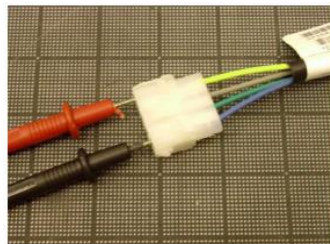
Figure 2: Set the multi-meter to ohms, and touch the red and black probes to the yellow and blue pins. The meter should show that there is continuity through the heating wire. If it does not, there is a break in the heating wire.

Figure 1: This is the 4 Pin connector at the end of the element harness. Disconnect the bonded wire harness and use a multi-meter to check for continuity.